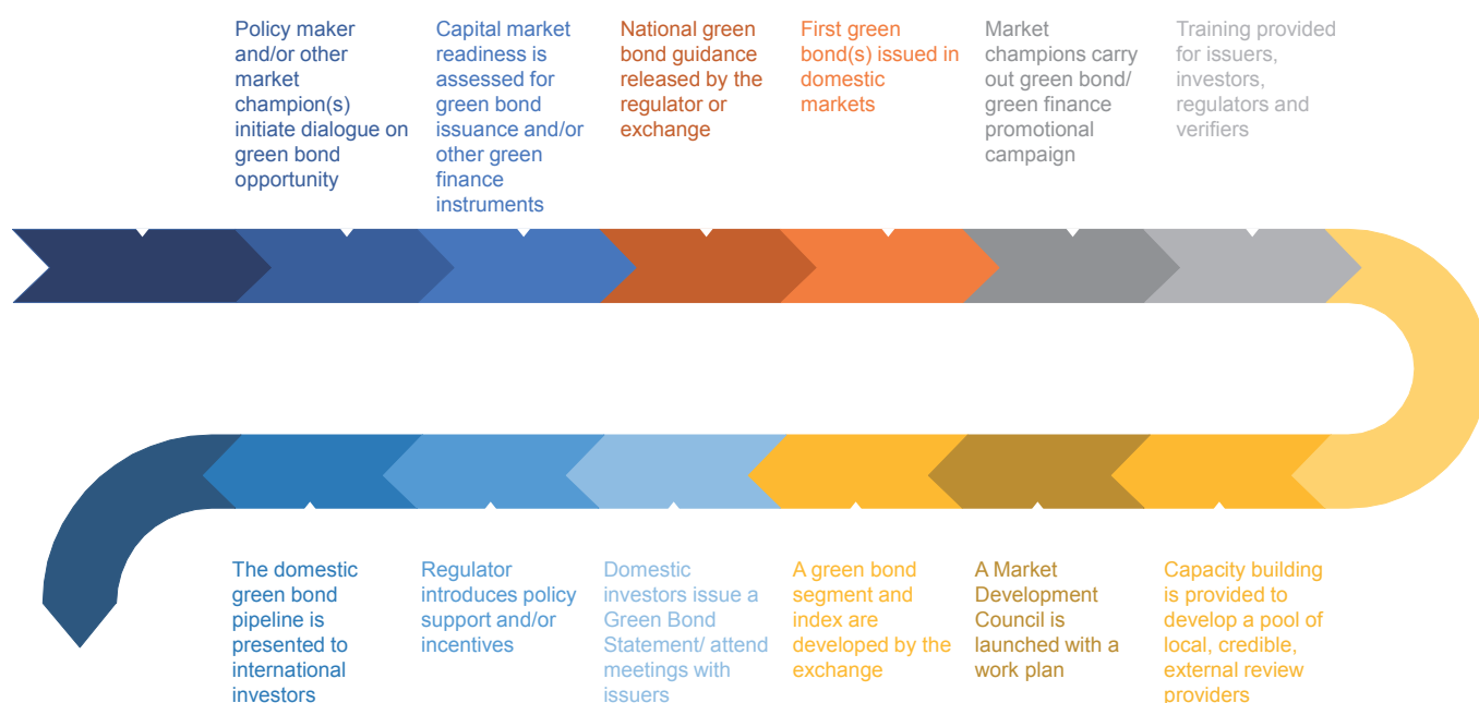
Figure 1: Roadmap with common milestones for developing green bond markets

The diagram below sets out a typical roadmap with milestones and a possible sequence. The roadmap gives countries starting the journey a sense of what lies ahead and lessons that can be drawn from the experiences of others. The milestones can be achieved in a different order depending on the drivers and market development strategy in place.